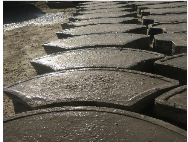
Fig 3. Paver block mould