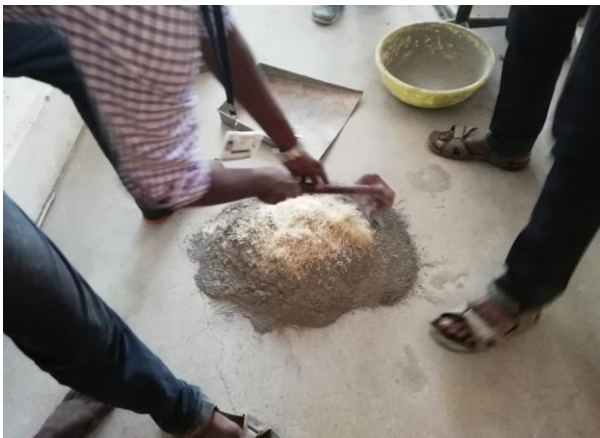
Fig 2. Concrete Mixing