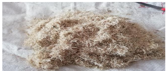
Fig 1. Sansevieria fiber

Aspect ratio = length of fiber/ diameter of fiber = 0.1/0.0002 = 50