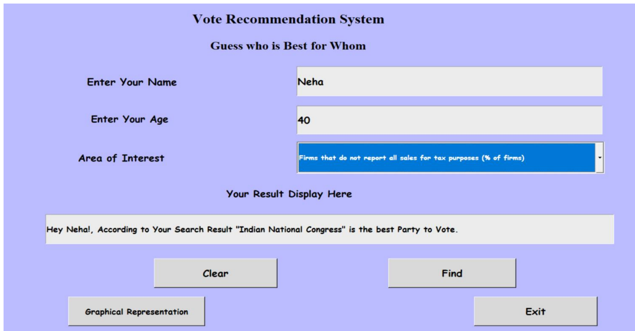
Fig. 4.Screenshot 2 of developed model

Fig.4 shows for Neha aged 40 years; according to his selected category, "Indian National Congress" is the best to vote.