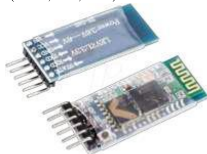
Figure 1. Bluetooth HC-05 Module

Bluetooth is a wireless data communication module that uses radio frequencies. The main function of this module is to replace the serial communication that used to be wired now to be wireless. Bluetooth consists of two types of devices, namely Master (data sender) and Slave (receiver). This HC-05 module is set by 9.600 bps by default (can be customized between 1200 bps to 1.35 Mbps). There are 2 types of types namely Bluetooth Module HC-06 series which can only act as slave devices, and Bluetooth Module HC-05 can also play a role as a bluetooth master device or slave, by default slave. (Dendi, Dkk, 2016).