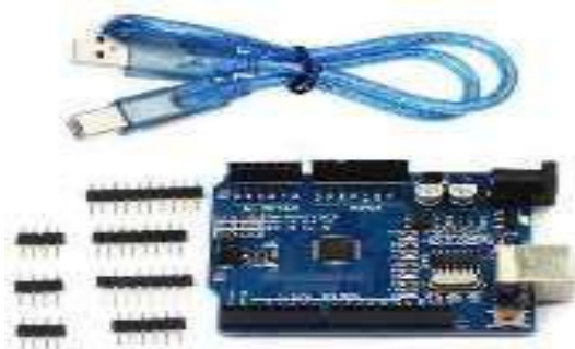
Figure 2 Arduino Uno R3 Board

Inside this microcontroller has additional features namely SDA and SCL pins which are located adjacent to the aref pin and two other new pins placed close to the RESET pin, another feature is the IO REF which functions to allow the device as a buffer to adapt to the voltage provided from system board. In its development Arduino Uno is compatible with AVR processors, operating at 5v DC power (Syahwil, 2014).