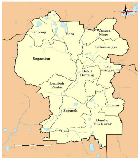
Fig 1: Map of Federal Territory of Kuala Lumpur

Data Analysis: Secondary data was utilised in this study and it was obtained from authorized agencies, which are Department of Statistic Malaysia (DOSM), National Solid Waste Management Department (NSWMD) and National Property Information Centre (NAPIC). A seventeen year database (2000-2017) was used in this study and it contained fourteen variables namely population, household income (RM), GDP per capita (RM), single storey terraced, 2-3 storey terraced, single storey semi-detached, 2-3 storey semi-detached, detached, town house, cluster, low cost house, low cost flat, flat, condominium/apartment and waste generation (tonnes/day). The variable of housing type used in this study is representing the income level of the household.