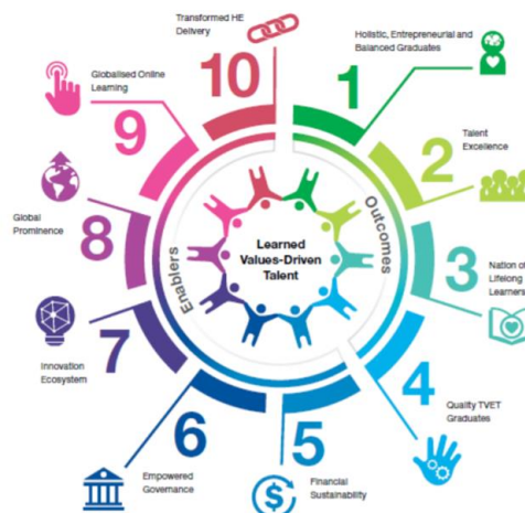
Figure 1. Malaysia Education Blueprint 2015-2025

of students who possess sound knowledge, creative and critical thinking, strong leadership skill, and communication skill, which allows them to function effectively at the global level"[15].