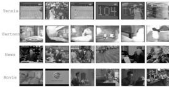
Fig.3 the model Input Frame