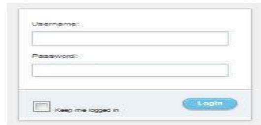
Figure 1. Login page