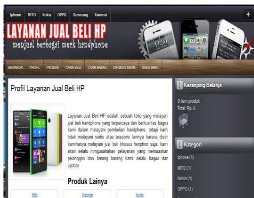
Figure 4. Profile page display