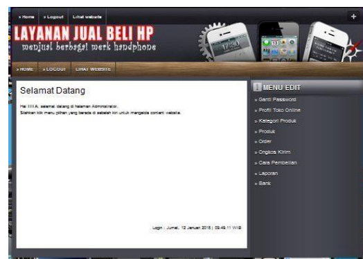
Figure 2. Admin Page Display

The administrator page is shown in figure 2.