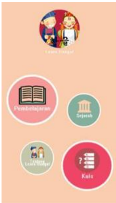
Figure 2. Main Page

Fig. 3 shows the brief history of the Korean language, while Fig. 4 explains the 'Learn Hangeul' application.