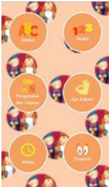
Figure 5. Learning and Quiz Category Page