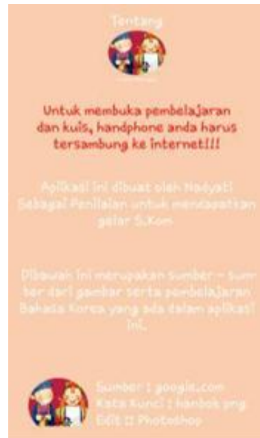
Figure 4. About Page

Fig. 3 shows the brief history of the Korean language, while Fig. 4 explains the 'Learn Hangeul' application.