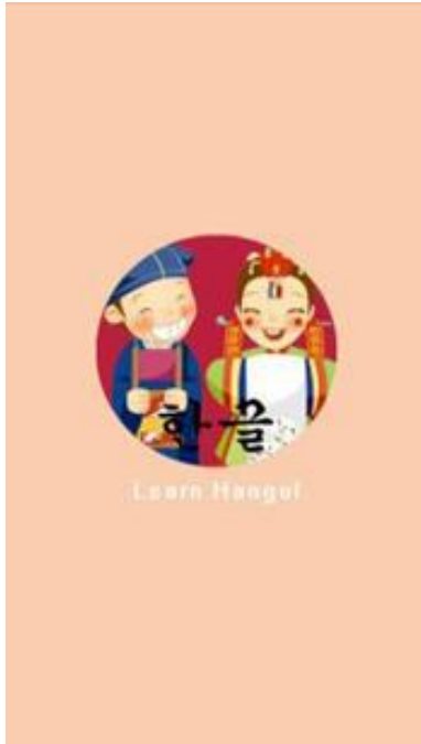
Figure 1. Home Page