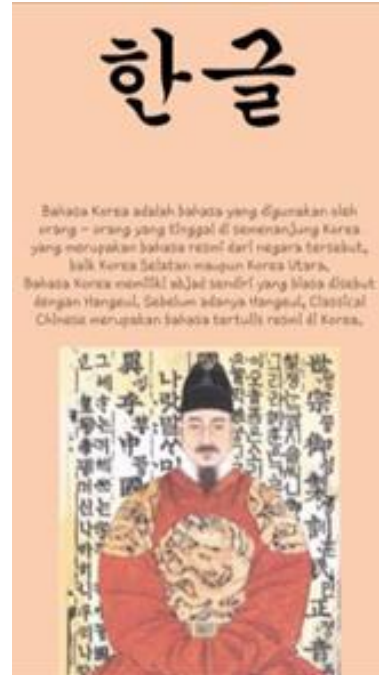
Figure 3. History Page