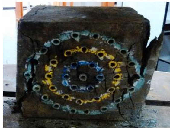
Fig.7 Cracking of concentric circle pattern test Specimen