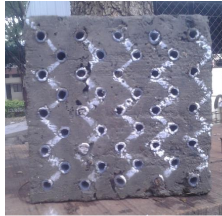
Fig.3 Test Specimen at Collapse

Control specimen for normal concrete is casted for M20 mix. With the same material used for control specimen, LiTraCon cubes are casted. Various shapes of PoF arrangement are selected and cubes are casted. Concrete cubes casted for various pattern of fiber arrangement are shown in Fig.3 (Zig-zag pattern), Fig.4 (Concentric circle pattern) and Fig.5 (Cluster pattern). For each pattern, three concrete cubes are casted. De-molding of cubes is made after 48 hours and the concrete cubes are kept in curing tank for a period of 28 days. After curing, concrete cubes are tested in universal testing machine for its compressive strength.