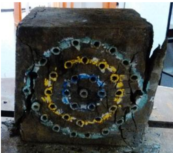
Fig.7 Cracking of concentric circle pattern test Specimen