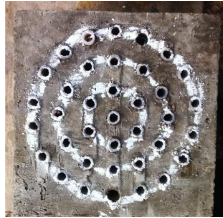
Fig.4 Test Specimen at Collapse