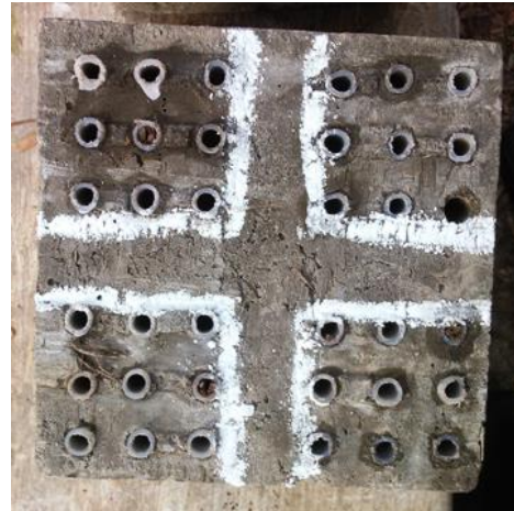
Fig.5 Test Specimen at Collapse