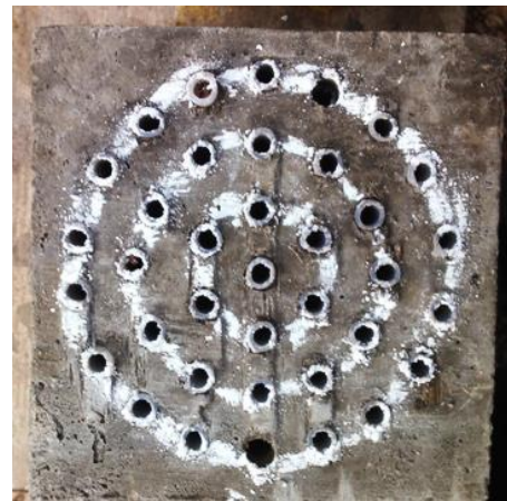
Fig.4 Test Specimen at Collapse