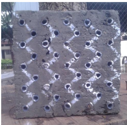
Fig.3 Test Specimen at Collapse

Control specimen for normal concrete is cased for M20 mix. With the same material used for control specimen, LiTraCon cubes are casted. Various shapes of PoF arrangement are selected and cubes are casted. Concrete cubes casted for various pattern of fiber arrangement are shown in Fig.3 (Zig-zag pattern), Fig.4 (Concentric circle pattern) and Fig.5 (Cluster pattern). For each pattern, three concrete cubes are casted. De-molding of cubes is made after 48 hours and the concrete cubes are kept in curing tank for a period of 28 days. After curing, concrete cubes are tested in universal testing machine for its compressive strength.