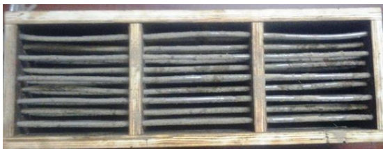
Fig.2 Test Specimen at Collapse

Fibers are inserted from one end and tightened at the other end. The distance between the fibers decides the nominal size of coarse aggregate. Fibers can be made tight at both the ends but should not be over stressed.