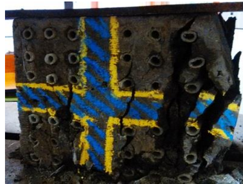
Fig.8 Cracking of cluster pattern test Specimen