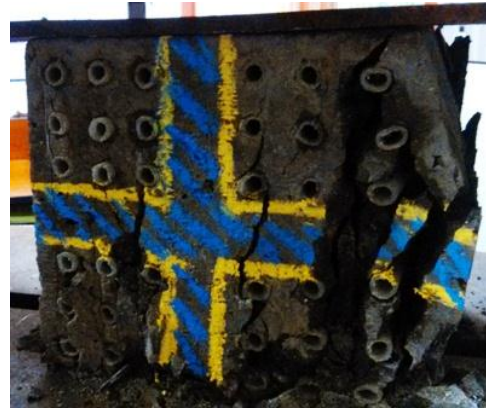
Fig.8 Cracking of cluster pattern test Specimen