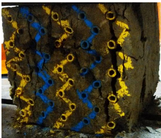
Fig.6 Cracking of zig-zag pattern test Specimen

Based on the crack pattern of various specimens, cracks initiation points are identified and in next trial, PoF at crack initiations are removed. Specimens are casted for modified fiber pattern. After curing period the specimens are tested for its compressive strength at various ageing. Modified concentric circle patter is shown in Fig.9 and modified cluster pattern is shown in Fig.10. Test results shows considerable increase in strength. If we remove central fiber, concentric circle pattern shows considerable increase in strength. Among the selected pattern, concentric circle pattern yields maximum strength.