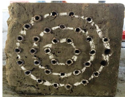
Fig.10 Cube casted with modified Concentric Circle Pattern