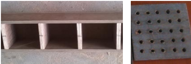
Fig.1 Mold and End Plate

150mm x 150mm x 150mm size cube mold are made with plywood. 10mm diameter holes are made in the end plates so that the PoF fibers can be inserted from one end and taken from the other end.