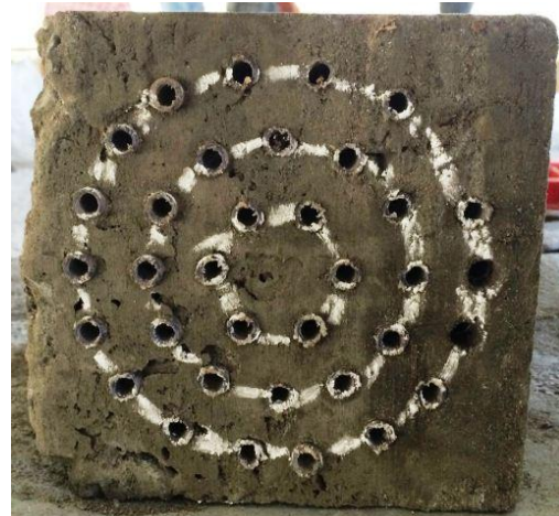
Fig.10 Cube casted with modified Concentric Circle Pattern