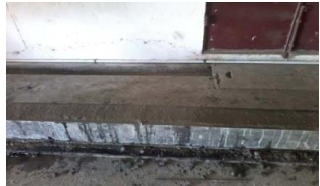
Fig 2 Casting of Beam and surface finishing

The mould sides are oiled and it is free from absorbing the cement paste. The reinforcement cages are place inside the moulds with sides, top and bottom cover blocks. Concrete mixing is done in 3 layers and compacting using tamping rod. Test specimens were remolded at the end of 48 hours of casting.