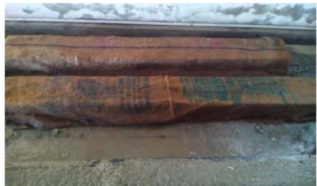
Fig 3. Curing of Specimens