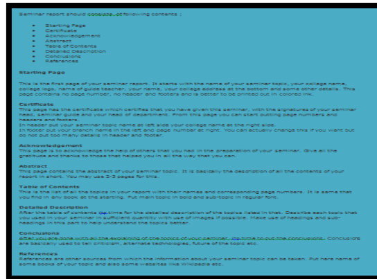
Fig: Result-How to make report

1. How To section will be for the guidance. Guidance about how to select topic, how to make report, how to make abstract, how to give presentation. It would also consists of marking scheme ,thus helping students to score more .The following figure shows search result for how to make seminar reports.