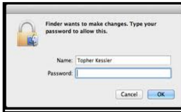
Fig-Authentication window for admin

With time, technology will change, there is no doubt in it, because every technology has one prominent feature i.e., it CHANGES. Now, the role of Admin comes into play. This section will be for the admin to add or delete projects, seminars, reports etc. according to the need and changes in technologies with time. An admin may insert Report, Abstract, Project (Mini/Major), Seminar (PPT). Thus; there is a provision to update the application periodically, for better usage. The following figure shows the authentication window for the admin of the project.