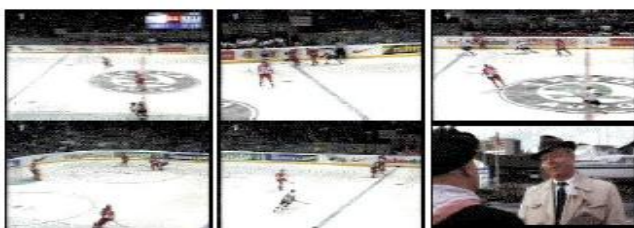
Fig. 5. A cluster obtained with the combined model.

In our future work, we intend to combine the two presented similarity models with other representations like color histograms or text descriptions. Additionally, we want to further investigate and improve the query performance especially on very large image repositories.