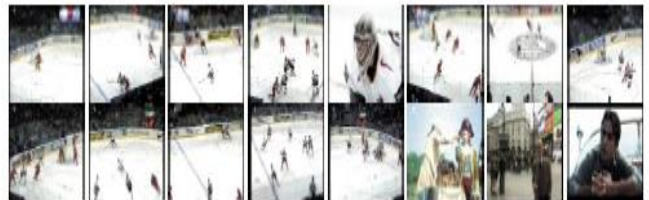
Fig. 2. A typical cluster obtained with the graph model.

Additionally, we can combine different similarity models to produce a better clustering result. Traditional clustering algorithms are based on one representation space. However, for complex objects often multiple representations exist for each object as in our case two different representations for each image. In [20], an efficient density-based approach to cluster such multi-represented data, taking all available representations into account, is presented. The authors propose two different techniques to combine the in-formation of all available representations dependent on the application.