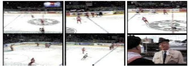
Fig. 5. A cluster obtained with the combined model.

In the diverse field of content-based image retrieval many different approaches have been proposed. In this paper, we described two models for image similarity which take into account structural as well as content information of an image. The presented models are based on tree and graph structures. With experiments on real-world data, we showed that the combination of those two approaches yields a performance gain concerning the specificity of the image retrieval process. This was done by means of clustering the images to compare the measures on a broad basis. In our future work, we intend to combine the two presented similarity models with other representations like color histograms or text descriptions. Additionally, we want to further investigate and improve the query performance especially on very large image repositories.