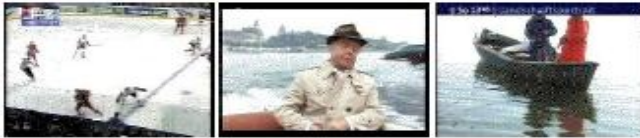
Fig. 3. A typical diverse cluster obtained with the graph model.

The results obtained with the two models separately were quite different. With the graph model we obtained several rather homogeneous clusters like the one depicted in figure 2 but also very diverse clusters like the one shown in figure 3. In general, it was possible to distinguish hockey images from the rest of the database rather well.