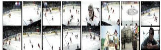
Fig. 2. A typical cluster obtained with the graph model.

Additionally, we can combine different similarity models to produce a better clustering result. Traditional clustering algorithms are based on one representation space. However, for complex objects often multiple representations exist for each object as in our case two different representations for each image. In [20], an efficient density-based approach to cluster such multi-represented data, taking all available representations into account, is presented. The authors propose two different techniques to combine the in-formation of all available representations dependent on the application.