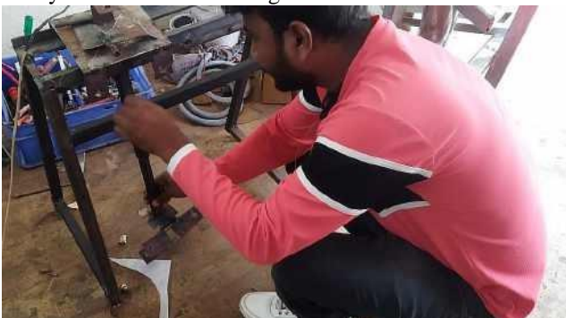
Fig. 4: Assembly of Tri-Head Gantry Crane

Assembly of components is performed to make Tri-Head Gantry Crane as shown in Fig.4