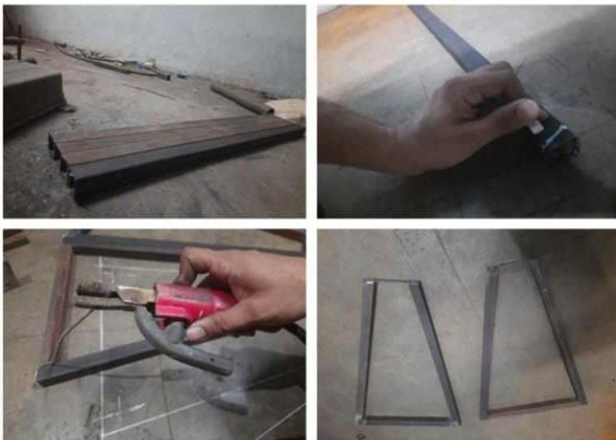
Fig. 3: Fabrication of Tri Head Gantry Crane Components

Fabrication of components of the Tri Head Gantry Crane is fabricated using mild steel material and the operations performed to fabricate the components are abrasive cutting, grinding, welding, drilling, etc., as shown in Fig.3