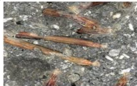
Fig.8. Digital Microscope DM /Clarification of pine fibre in concrete