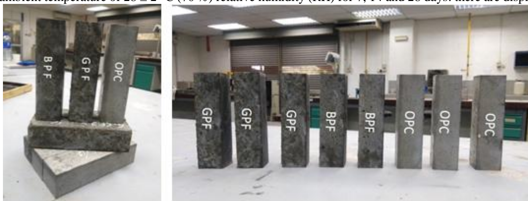
Fig. 3. Prepare samples for testing of flexural strength

Concrete flexural strength was obtained by 40 mm X40 mm X160 mm prism testing and assessed according to ASTM C109 [13]. At an ambient temperature of 28 \pm 2 °C (70 %) relative humidity (RH) for 7, 14 and 28 days. there are displayed in fig 3.