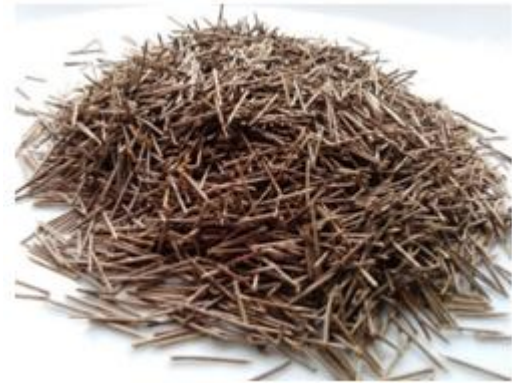
Brown pine fibre (BPF)

Note: FPN is fibre of pine tree needle leaves, BPF is brown pine fibre, GPF is Green pine fibre, w/b is water cement ratio.