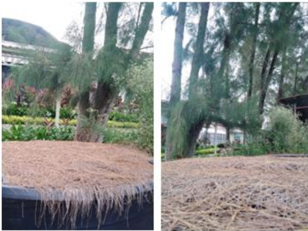
FIG. 2. prepare the fibre from needles pine leaves