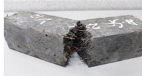
Fig. 6 Brown pine fibre is more durable than green pine fibre