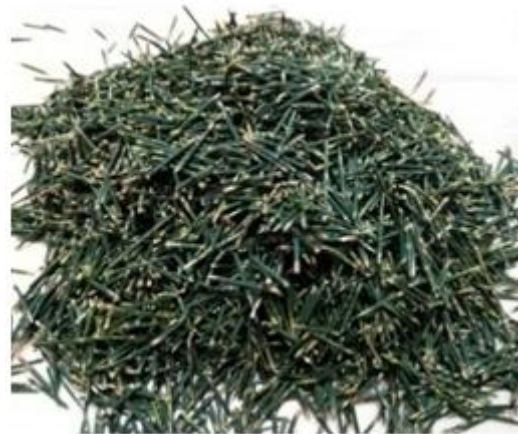
Green pine fibre (GPF)