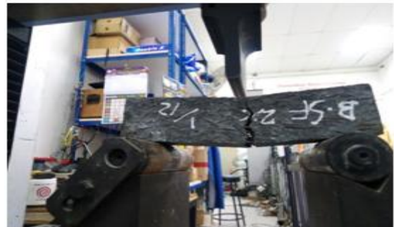
Fig. 5. flexural strength test during laboratory work