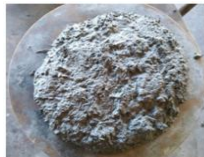
Fig.9. Flow table